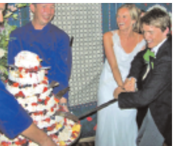
❑ GIANT PAVLOVA WEDDING CAKE

OUR SELECTION OF PUDDINGS ARE SIMPLY MOUTH-WATERING