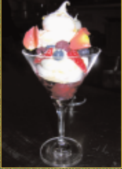
PAVLOVA IN COCKTAIL GLASS