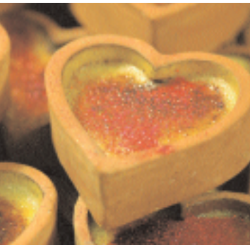
❑ CREME BRULEE WITH EDIBLE GLITTER