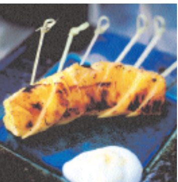
❑ GRIDDLED PINEAPPLE SKEWERS