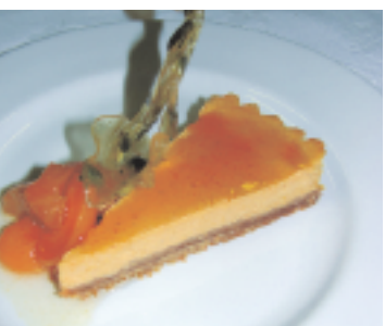
❑ BUTTERNUT SQUASH CHEESECAKE